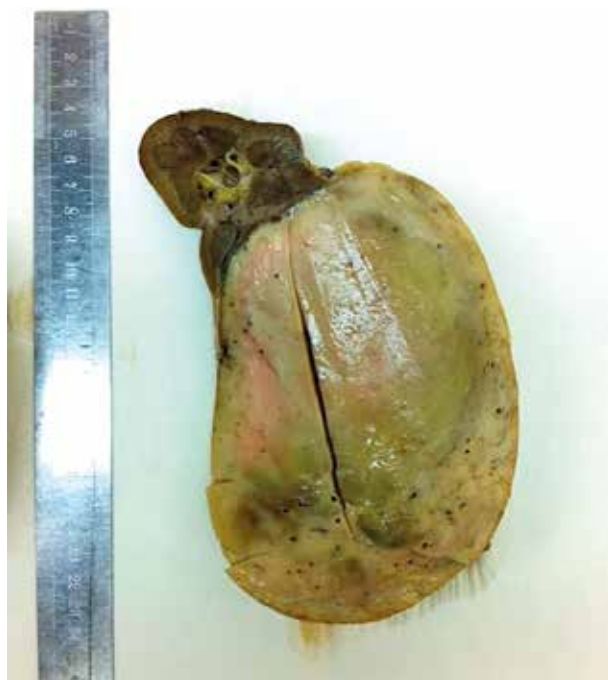
Fig. 2. Macroscopically: Well circumscribed, solid, firm, light tan tumour 15 cm in diameter compressing the kidney's parenchyma